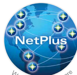
Web Interface Software

Accurate Analysis – Anything, Anywhere, Anytime, Anybody.